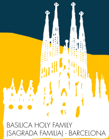
BASILICA HOLY FAMILY (SAGRADA FAMILIA) - BARCELONA