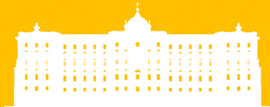
ROYAL PALACE - MADRID

ENJOY ITS STABLE GEOPOLITICAL ENVIRONMENT