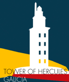
TOWER OF HERCULES GALICIA

SIGHTSEEING PLACES, HISTORICAL SITES AND CULTURE: 45 UNESCO SITES: 3RD COUNTRY IN THE WORLD BEHIND ITALY & CHINA.